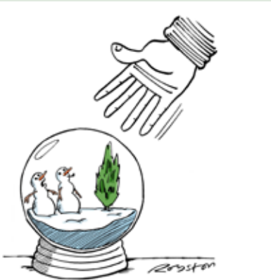
"Looks like we're in for another extreme weather event."